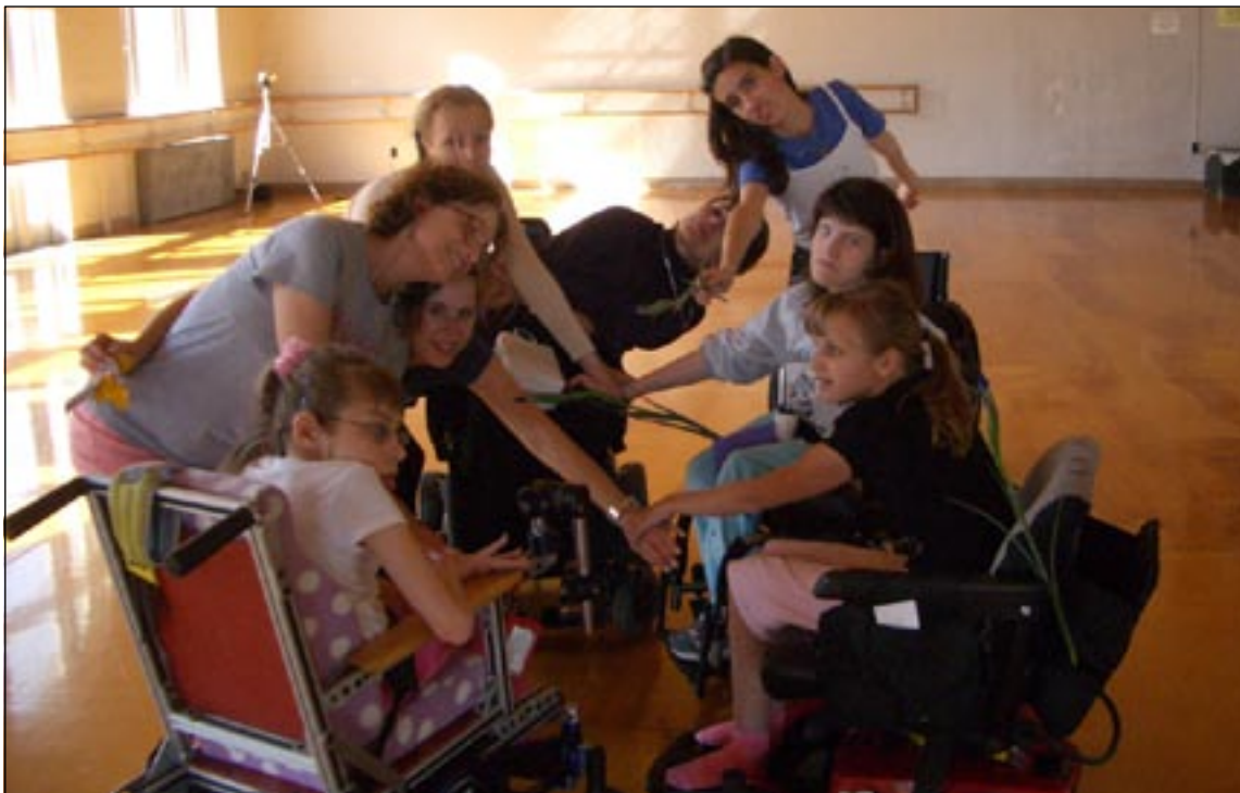
AXIS Dance Company, 2007. Photo taken during Creative Dance Class for teens with and without disabilities.