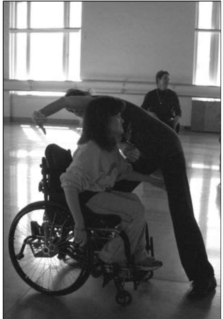
AXIS Dance Company, 2007. Photo taken during Creative Dance Class for teens with and without disabilities.